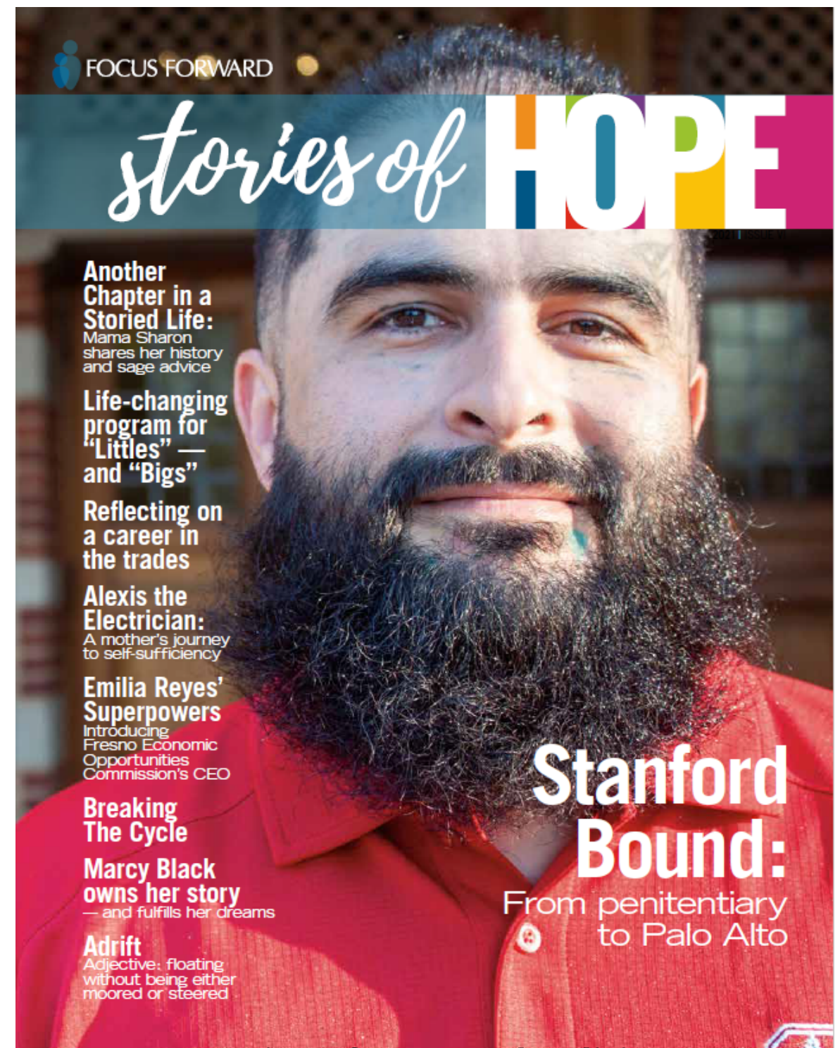
Stories of Hope, 6th edition

10,000 copies printed and distributed throughout Fresno County and beyond